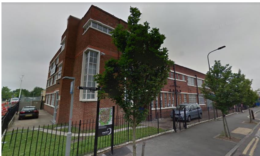
Endecotts, 9 Lombard Road