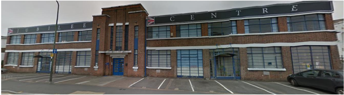
Jubilee Centre, 10-12, Lombard Road