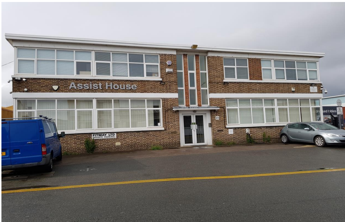
Assist House, 25 Lombard Road. (Fitmay House)

The Lombard Trading Estate was previously known as Morden Factory Estate. It was mainly developed by Commercial Structures Limited. The G H Zeal factory