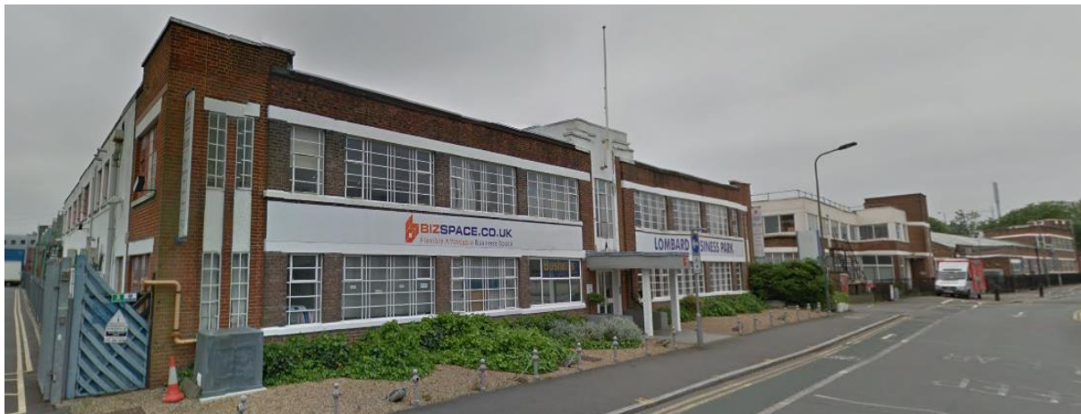
Lombard Business Park, 8 Lombard Road