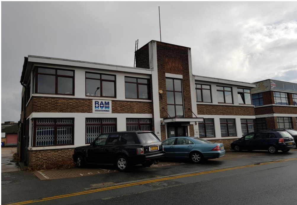
14 Lombard Road. (RAM)