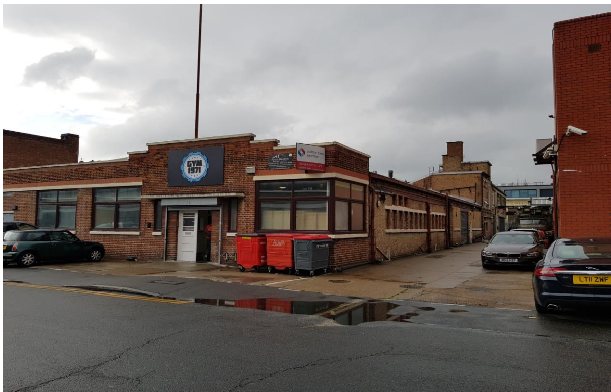
Globe House, 21 Lombard Road (Gym 1971)