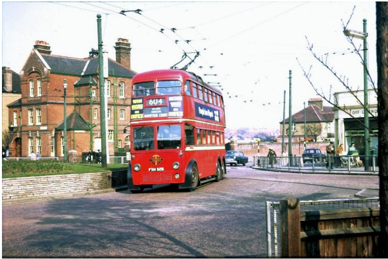
The Fountain, 1528

Trolleybus on route from Burlington Road.