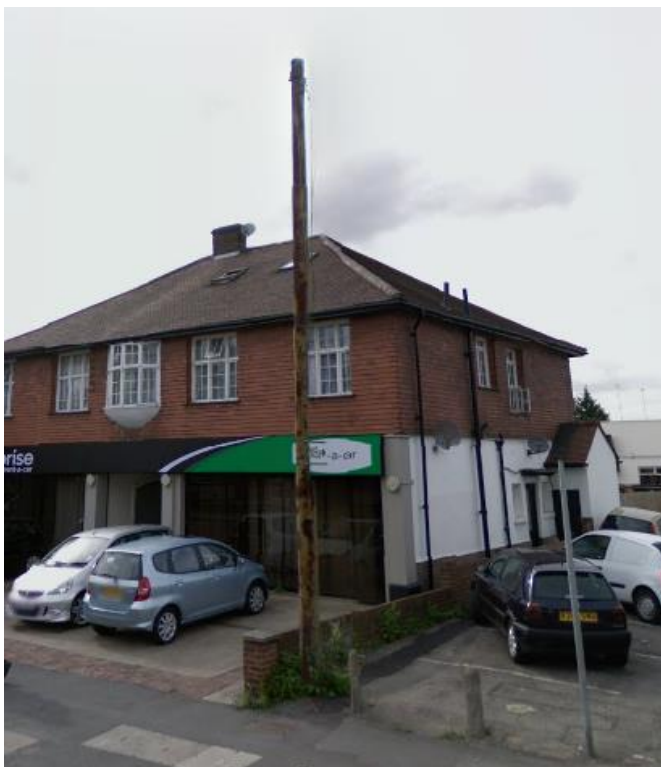
241-243 Burlington Road

Trolleybus on route from Burlington Road.